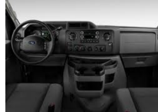
Our new 2012 15-passenger Ford van

We are proud to present to you our new Ford van. Thanks to the donations given during the Christmas Season, we were able to spend time searching for the right vehicle and, with cash in our hands, we made a great deal.